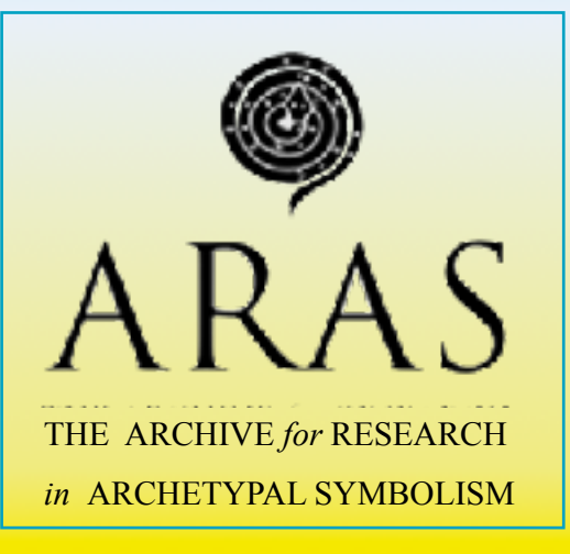
More about the image: https://aras.org/sites/default/files/docs/ 000149Singer.pdf

Submissions will be published at: aras.org/wuj