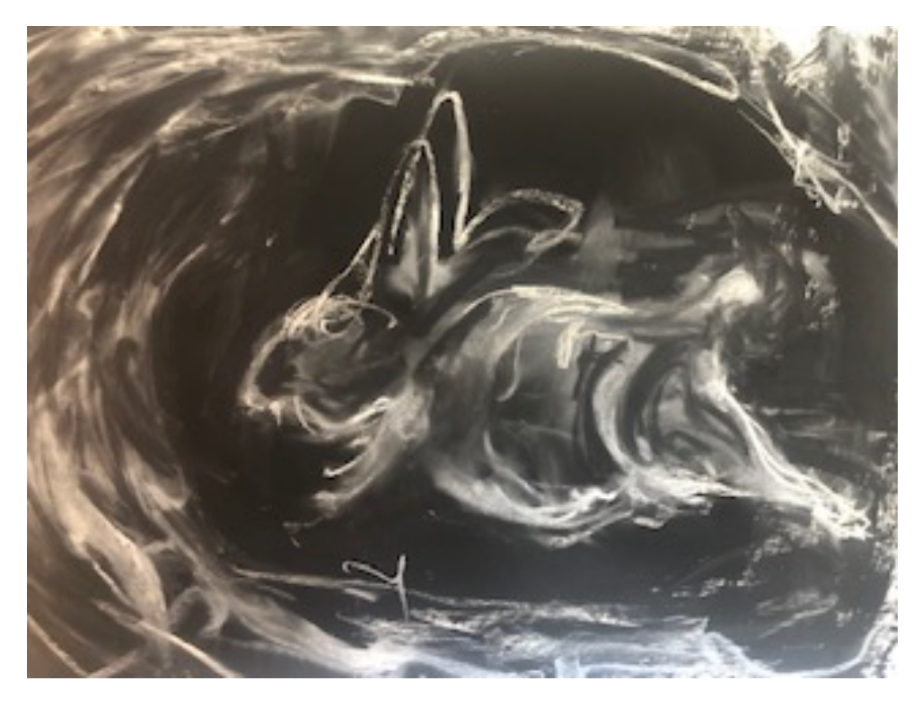
Figure 6 McRoberts (2021). Down the Rabbit Hole. [Charcoal on paper].