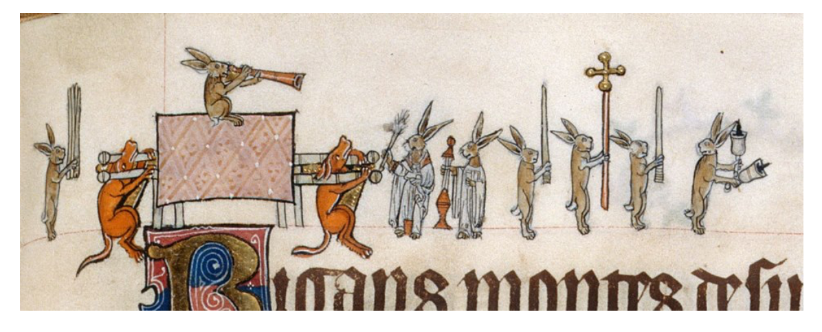
Figure 15 14<sup>th</sup> Century English Manuscript. The World Upside Down. [Drollery].

Rabbits participating in human activities were frequent subjects in medieval art, known as "drolleries" or "grotesques" (Kern, 2016, Figure 15).