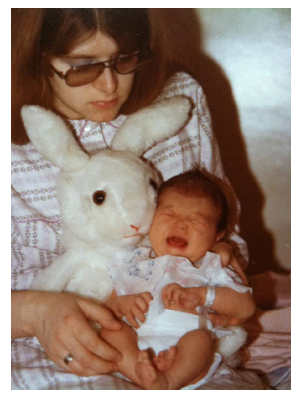
Figure 5 Born with the White Rabbit. Photo of Author and Mother, taken by Father

My mother bought a White Rabbit puppet when she was pregnant with me and used it as a focus object during her labor. I still have and cherish that puppet to this day. I had forgotten the photograph, though, and when I came upon it, found that it had