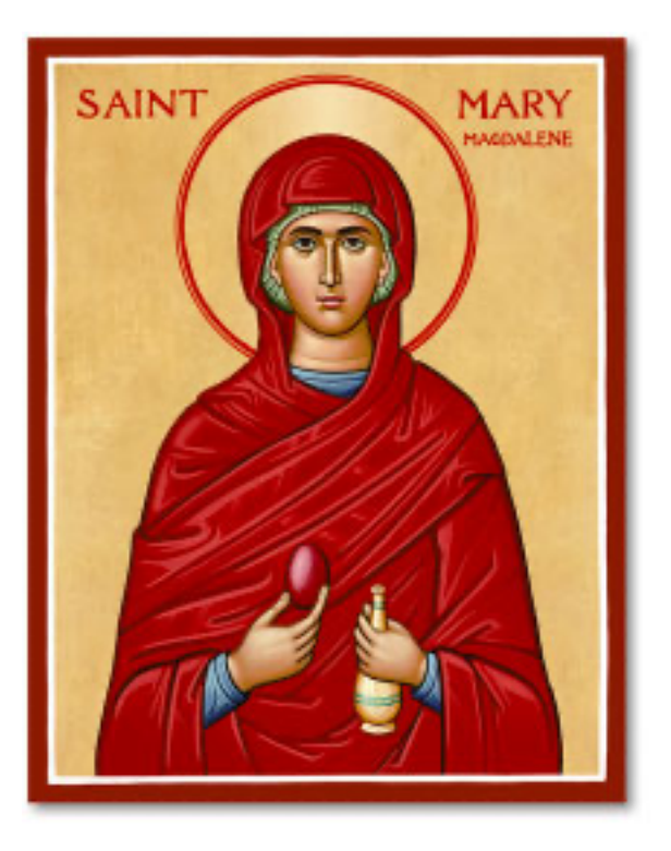
Figure 12 Saint Mary Magdalene & the Red Egg (Monastery Icons, 2022)

Mary Magdalene was misrepresented as a repentant prostitute in sermons and writings for hundreds of years before being canonized as a saint by the Catholic Church in 1988 and being declared "Apostle of the apostles" in 2016 (Holy See Press Office, 2016). In the contemporary political lexicon, "chasing the white rabbit" is used to describe both the act of creating a cover story, and one's wily fascination with discovering the truth (Urban Dictionary, 2021).