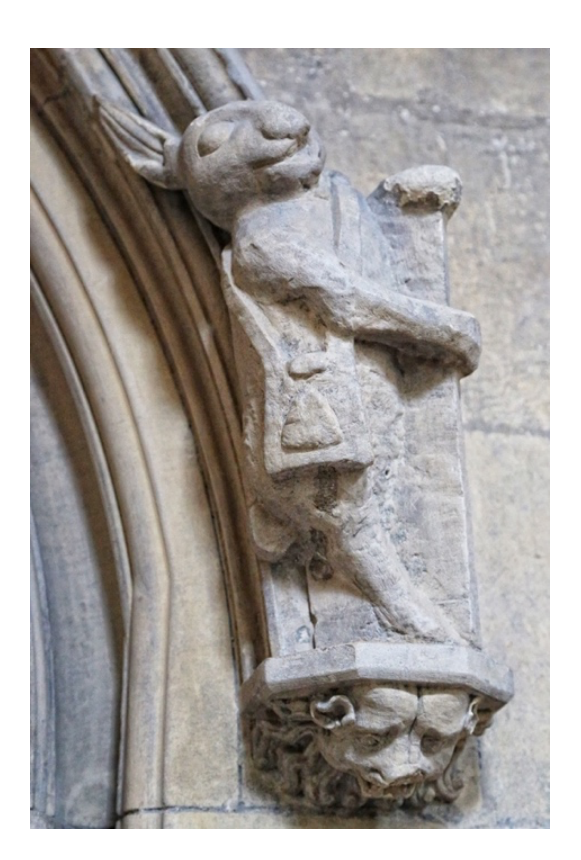
Figure 13 The Pilgrim Hare, St. Mary's Church, Yorkshire (The Pilgrim Rabbit,