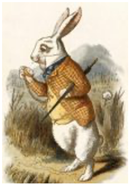
Tenniel's White Rabbit