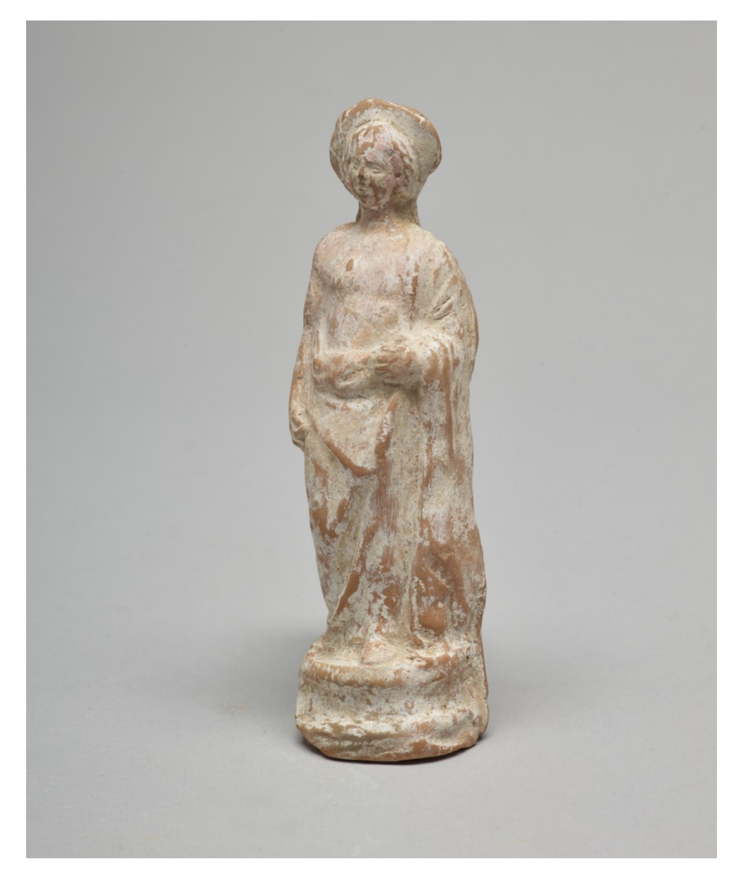
Figure 10 Creator Unknown (c. 400 BCE - 300 BCE). Figurine. [molded terracotta, pink and white slip]. Artemis with bow and rabbit.

The belief that rabbits could reproduce as virgins persisted from the ancient Greeks until the medieval period, when the White Rabbit became an allegory of the Virgin Mary's immaculate conception (Catholic Online, 2021; see Figure 11).