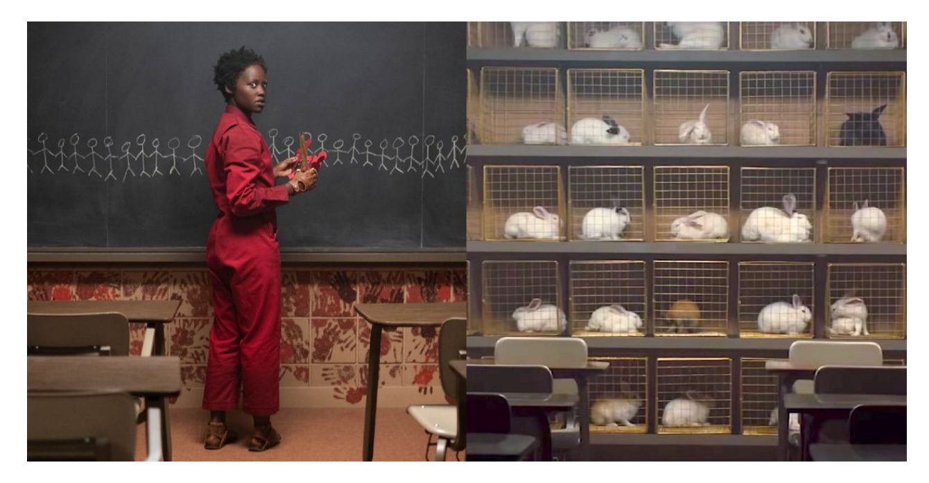
Figure 17 Us (Peele, 2019)

underground, they may be connected (tethered) to those above; at the end of the film, rabbits can be seen above running free.