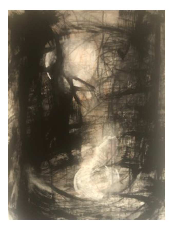
Figure 7 McRoberts (2021). White Rabbit Gazing at the Moon. [Mixed media].

The images in this paper are strictly for educational use and are protected by United States copyright laws. 13 Unauthorized use will result in criminal and civil penalties.