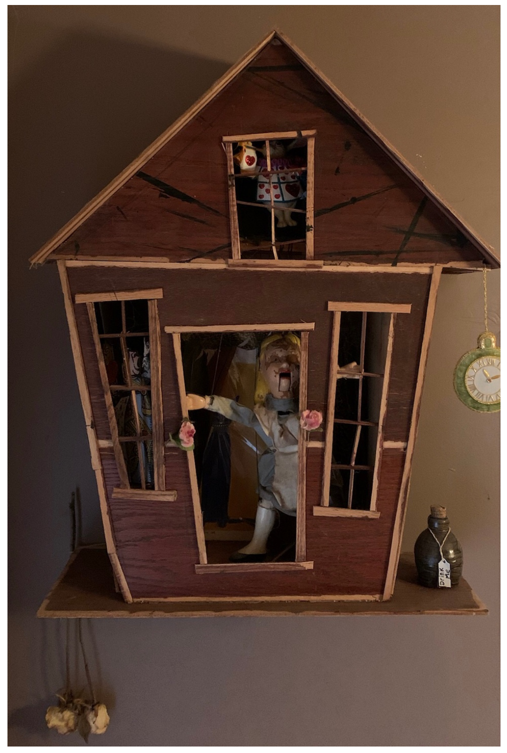
Figure 3 McRoberts, (N.D.). The Rabbit's House. [Assemblage & Mixed Media: Ornaments, marionette, handmade bottle and tag, greeting card, dried flowers, wood]. Author's personal collection.