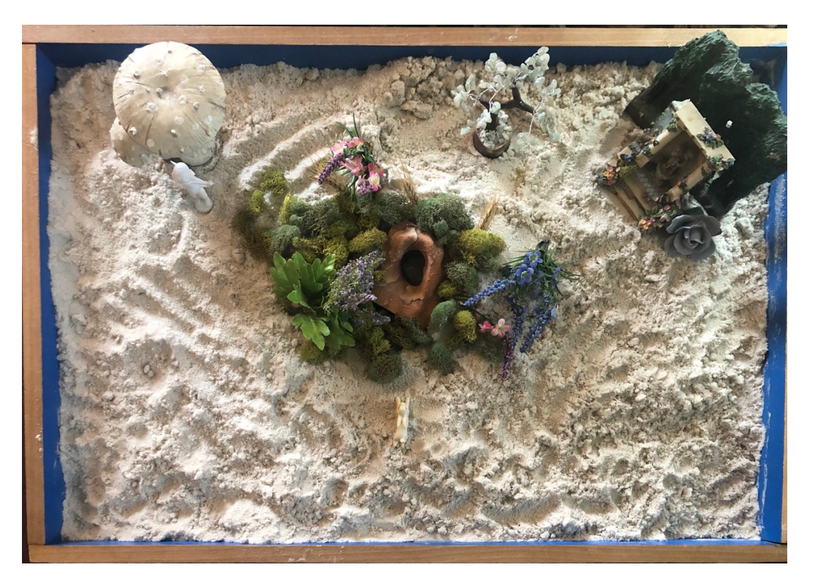
Figure 9 McRoberts (2021). Following the White Rabbit

Upon reflection, I recall lyrics from the movie Labyrinth (Henson, 1986),