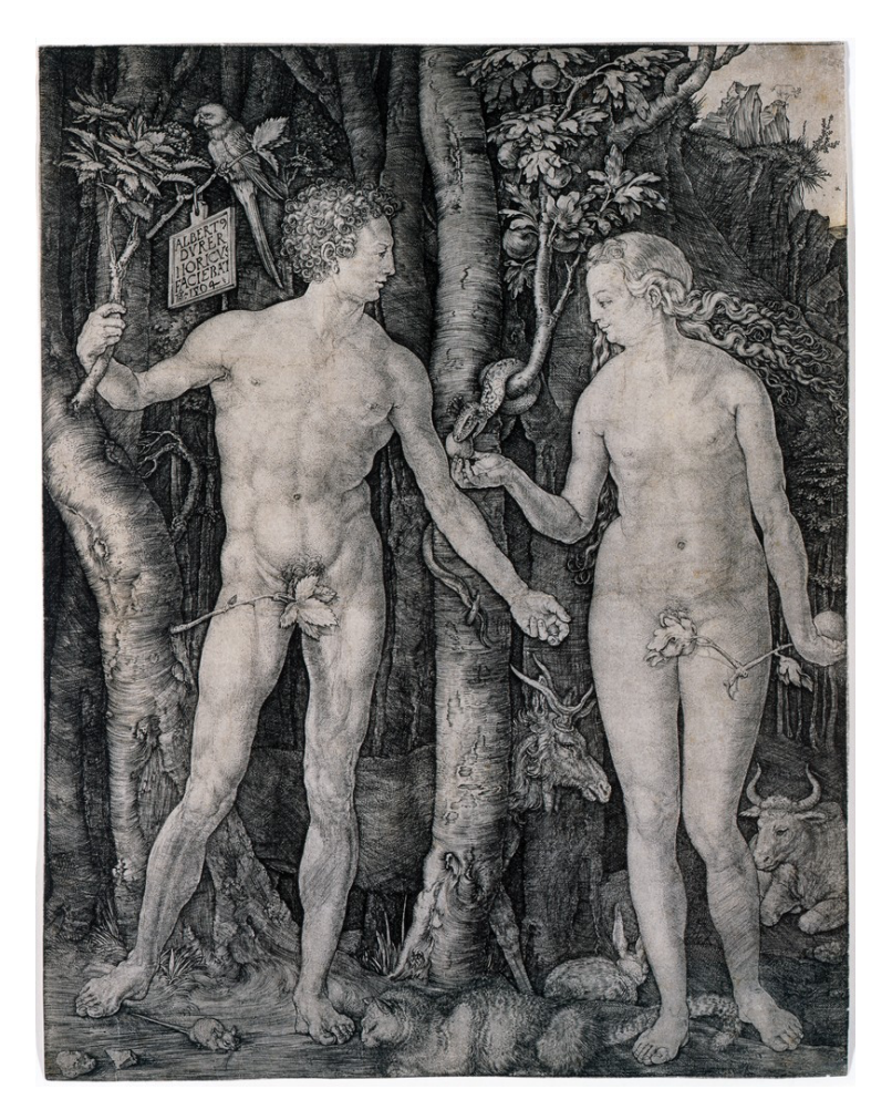
Figure 16 Duer, (1504). Adam and Eve (The Fall of Man). [Intaglio].

The symbolism of the color white further amplifies other aspects of the rabbit in its duality (Stevens, 1998), especially at mid-life; white can be a symbol of both purity, surrender, and death of a previous life, such as a Western bride's wedding gown, or a flag waved for a truce in battle. Unfortunately, the White Rabbit has also become associated with far right political and Christian extremism, racism, and men's rights (O'Callaghan et al., 2015). I am reminded of how the White Rabbit in the Alice books