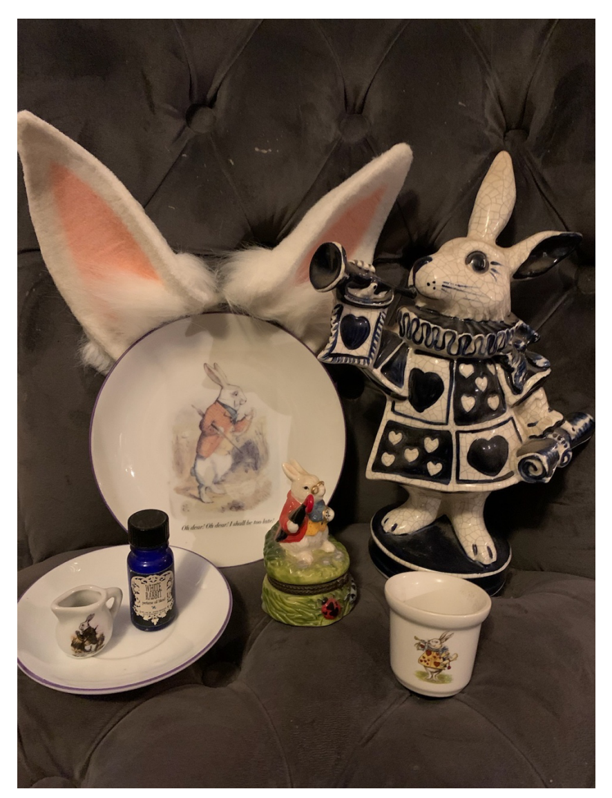
Figure 1 Selection of White Rabbit memorabilia from author's personal collection. Perfume by Black Phoenix Alchemy Lab. Tea-set by Rutter Porzellan, Germany (1993).

The White Rabbit has always been a symbolic companion of mine. Since I was a child, I have collected Alice in Wonderland and Through the Lookingglass (Carroll, 1865/1871/1960) memorabilia, most of it given to me as gifts from loved ones. From porcelain figurines and embellished teacups, to indie theater posters and interpretations in perfumery, White Rabbits dot my home and studio (see Figures 1- 3).