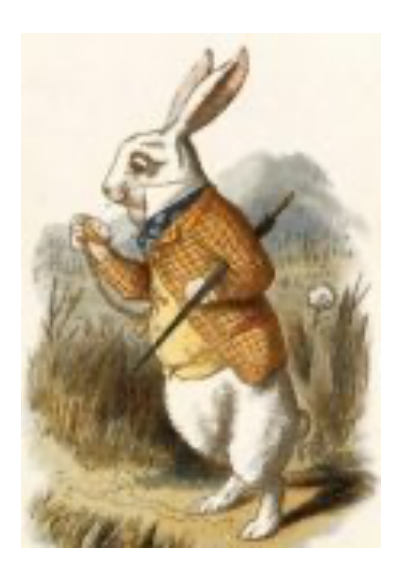
Figure 14 Tenniel's White Rabbit