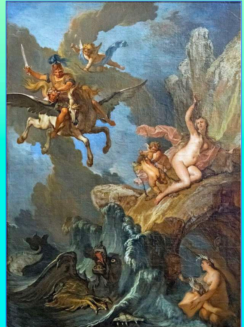
Perseus Freeing Andromeda, by Nicolas Bertin 1700 - 1725. Oil on canvas,. Musée des Beaux-Arts de Carcassonne.

In this webinar we journey into the timeless zone where contemporary consciousness meets an unchanging collective unconscious and discover again that myths can be, as Jung said, 'first and foremost , psychic phenomena that reveal the state of the soul.'