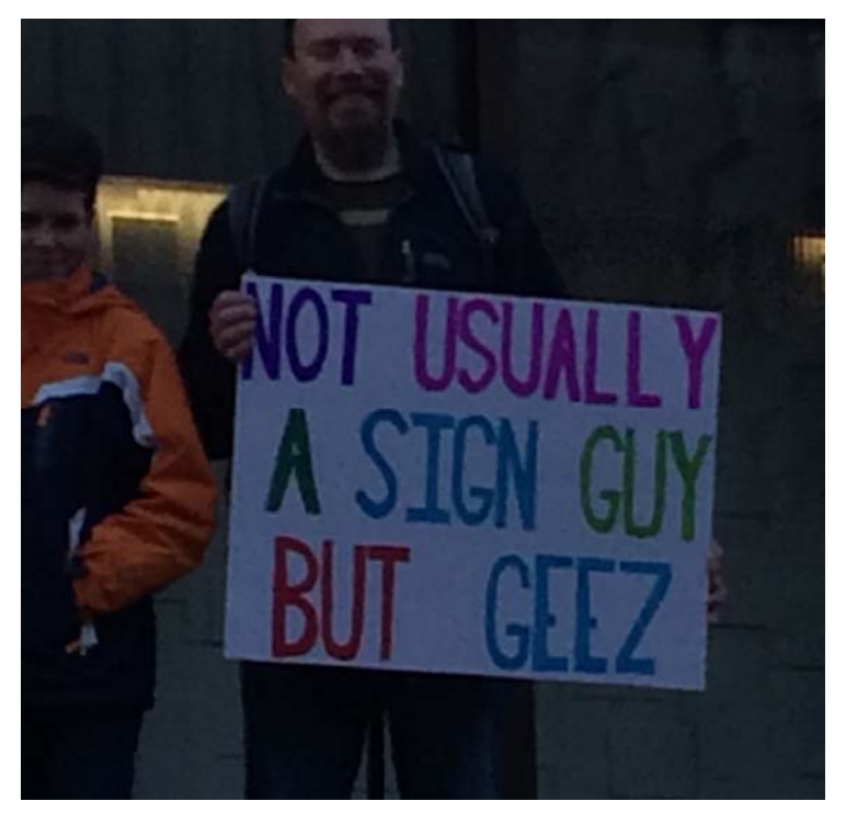
This paper is strictly for educational use and is protected by United States copyright laws. Unauthorized use will result in criminal and civil penalties.