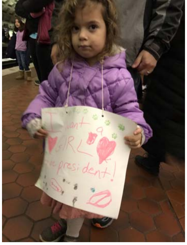
This paper is strictly for educational use and is protected by United States copyright laws. Unauthorized use will result in criminal and civil penalties.