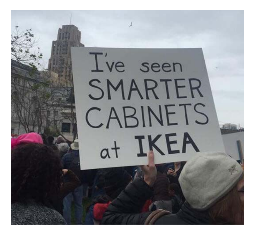
This paper is strictly for educational use and is protected by United States copyright laws. Unauthorized use will result in criminal and civil penalties.