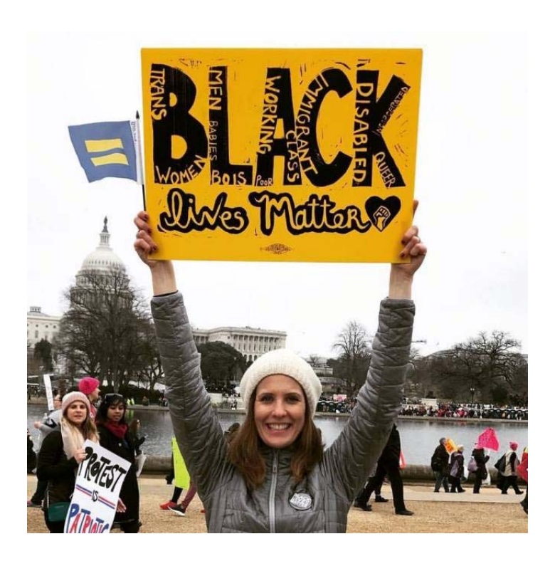
This paper is strictly for educational use and is protected by United States copyright laws. Unauthorized use will result in criminal and civil penalties.

There was consideration of each other, yielding and helping out, bursts of laughter at reading some signs, some singing, some chanting, and a sense of participating in something significant and wonderful. The signs were inclusive, and made us think as well: "Black Lives Matter", "Medicare for All" "This is what a Muslim looks like!" "My Great Grandmother didn't escape Warsaw for this!" Sign carried by an elderly white haired Japanese-American woman in a wheelchair: "Locked up by US Prez, 1942 -1946. Never Again!" LGBT rainbow flags.