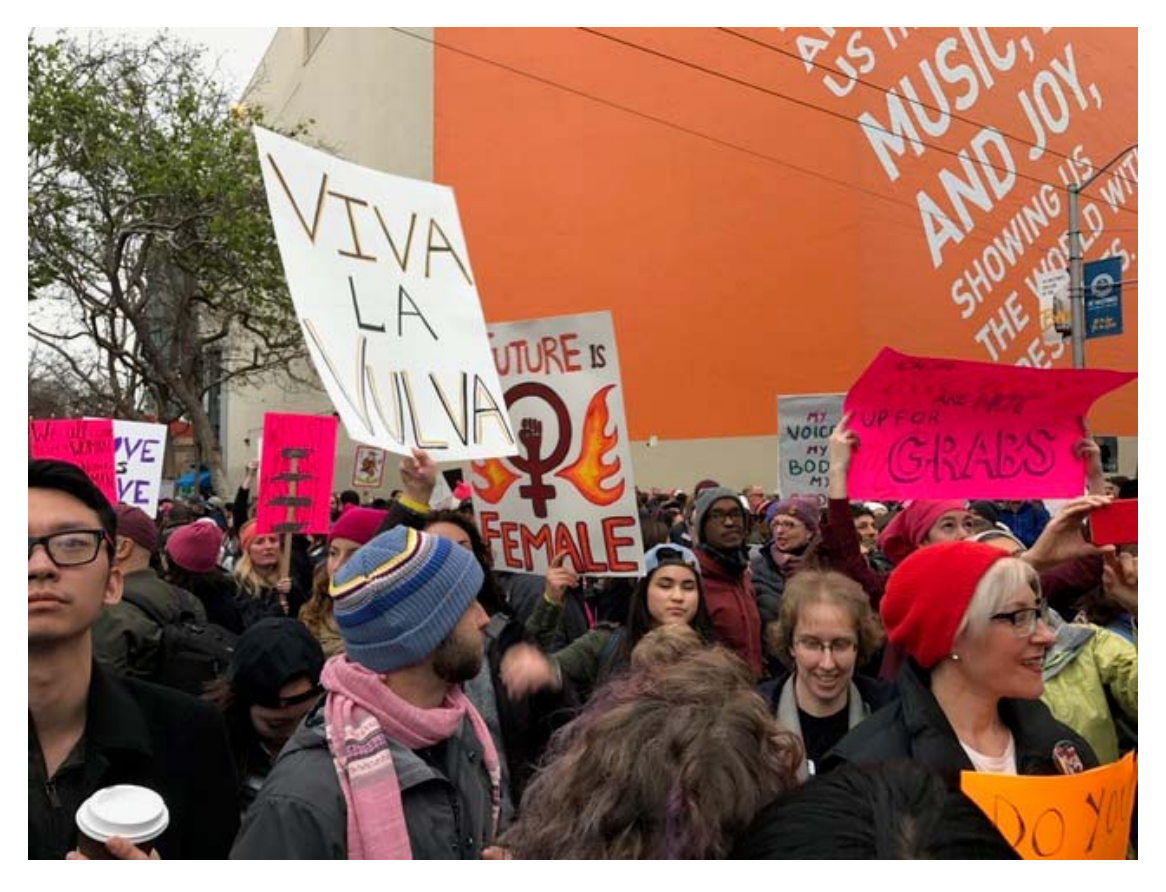
This paper is strictly for educational use and is protected by United States copyright laws. Unauthorized use will result in criminal and civil penalties.