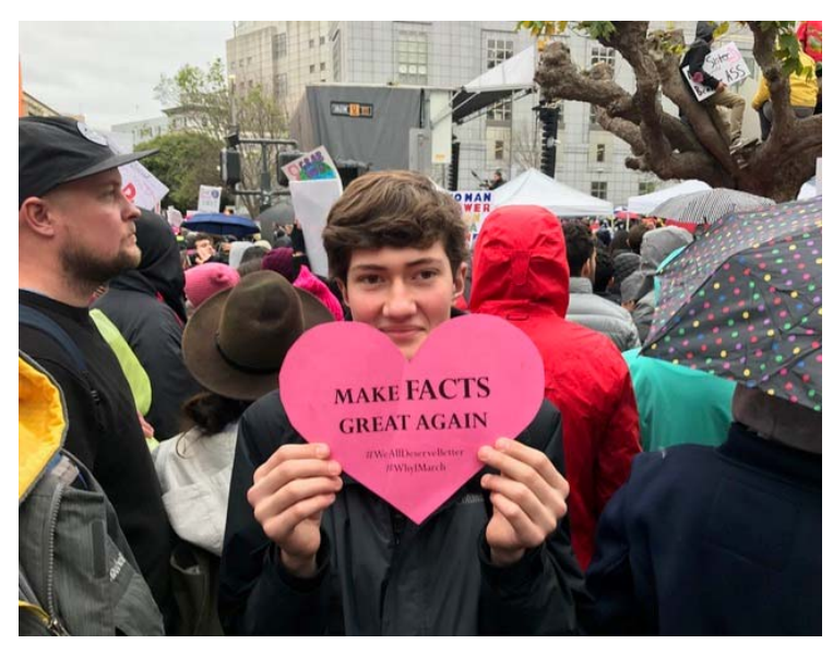
This paper is strictly for educational use and is protected by United States copyright laws. Unauthorized use will result in criminal and civil penalties.