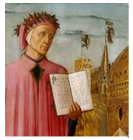
Figure 3 Domenico di Michelino, Dante's Commedia, 1465

adorns the head they can be compared to the distinction of a crown or a wreath of laurel. Indeed, there is a great resemblance between halos and crowns in both appearance and purpose. Both have existed in history for several centuries and both are worn on the head giving that part of our bodies more significance. They're an important part of a uniform's insignia which alerts the viewers of the stature of the person being portrayed.