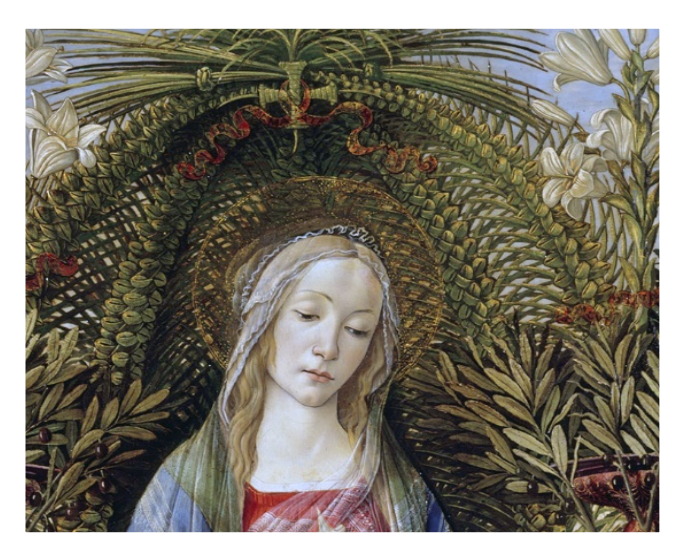
Figure 2 Sandro Botticelli, Detail of Bardi Madonna with Saints , 1485, Berlin with pleaching

As it turned out, research revealed to me that it was mostly in Italy that halos were so diversified. Typically, halos are round and are either presented as a solid plate, a ring of light or a crown. Sometimes facsimiles of halos appear composed of vegetation, fabrics or architecture. When vegetation is woven together it's called pleaching .