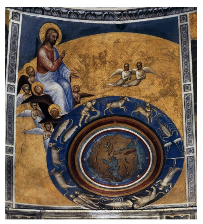
Figure 15 Giusto de Menabuoi, The Creation , 1375-76, Padua

Between the twelfth and sixteenth centuries, the shapes and styles of halos noticeably evolved. They grew from simple, round circles into elaborately decorated crowns, lavished with finishing touches. These changes were caused by several shifts in social, economic, religious, and artistic adjustments. Much is due to the prodigious amount of philosophical growth and humanity's new selfawareness during these years that