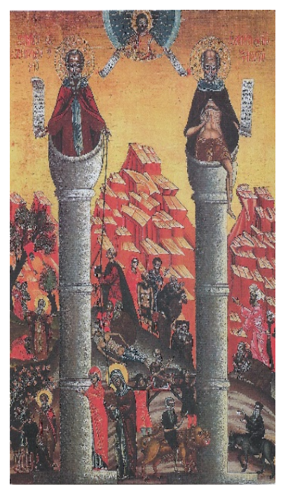
Figure 4 Simion the Stylite, Elder and Younger, 1699, icon

form from the light of the sun or the moon. Coincidentally, or not, pillar saints are found in icon paintings. These were saints who spent many days and nights sitting on top of a pillar in early Christianity, espousing the religion's dogma to those below. Early Christian art shows examples of saints being tended to from persons below by using ropes to lift or retrieve supplies, as you can imagine were necessary.