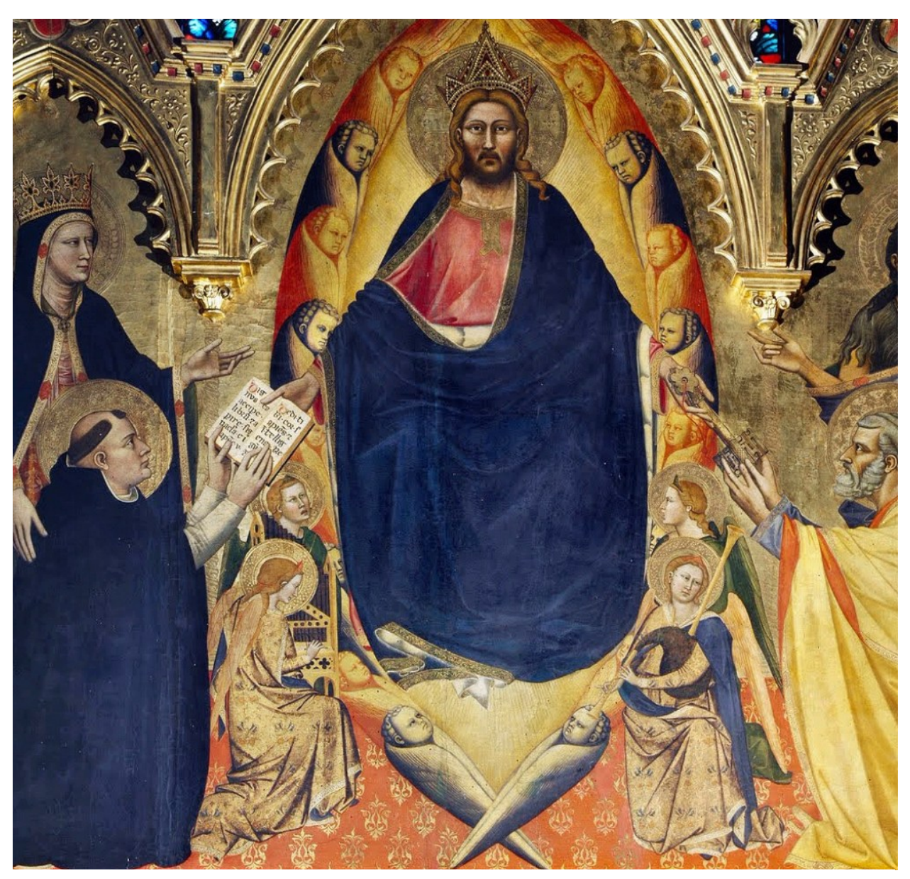
Figure 14 Andrea Orcagna, Detail from Strozzi Altarpiece, 1354-57.

Imagine being in a dark church lit only with candles and notice how the light flickers off the gold surface, especially gold that has been punched, raised or embossed. The sparkling texture adds to the sacred imagery. In early sacred art gold was the most important ingredient only surpassed in cost and usage by the beautiful and rare lapis lazuli. The use of pounding tools has been studied in recent years helping us to identify the artists of works in art. Each workshop ( bottega ) used unique forms on tools to