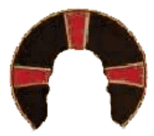
Figure 9 Halo design from a pattern book.

The codes of illustrating and explaining bible stories constantly changed during the Medieval years. Hierarchy was adhered to so that a lifestyle was constructed based on the hours of the day, the rhythm of the dance and the stature of importance within the church and community. Christianity was a new faith that had to be integrated into an already built system of power, government and military. Donors of art or money for the building and decoration of churches and public venues were sometimes portrayed with an emblem of divinity. At times a generous donor was commended in art by portraying them with a halo in the shape of a square. This conspicuously identified the person as one who was held in high esteem by the church as well as suggest that s(he) was on their way to acquiring an angelic position after death. This is another clue offered by halos when dating art. The square halo shows that the person wearing it was still alive at the time when the art was created.