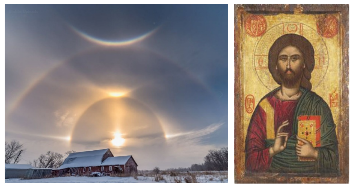
Figure 6 Sundog Halo

style of the beard were all dictated within the pages of Pseudo Dionysius' book of codes. Also included in the book was the hierarchy of angels. One of us today might think that an angel with a simple circular halo represents the highest form of angels, save for the archangels. Not so! There is a system of three levels of angels with three equal counterparts in each level. Interestingly, not all angels wear halos, just as not all angels wear wings.