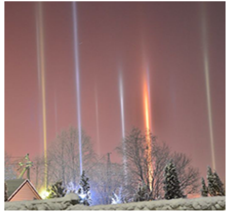
Figure 5 Pillar Halos, methode_times_prod_web_bin_7d956a8a-3f08-11eb-83a7-25db7141c256

Another fascinating similarity is between the Cruciform halo and what we call sundog halos. Only God or Christ wear a circular halo with the cross bars within it. That is a distinction carried from the earliest Christian codes of how to represent the Father and Son. Pseudo Dionysius of Areopagite, a first century philosopher and judge of Athens who worked with religious scholars, published a detailed book of rules for how artists were to render the appearance of saints, angels and holy people in art. The color of the clothes worn, the length of the hair, whether a beard was included as well as the