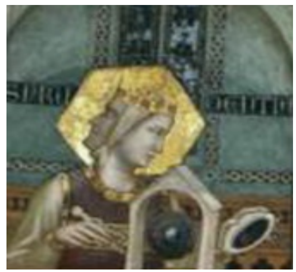
Figure 10 Giotto di Bondoni, Allegory of Obedience, 1320, Assisi

Another order of angels represented in art were the seven virtues. In Italian art the virtues were portrayed wearing six-sided halos. The Holy Trinity is depicted with God wearing a triangular halo; a distinction reserved for the highest of importance. Mandorla, an Italian word meaning almond-shaped, is a full-body halo usually reserved for the mother Mary, Jesus or God. These codes were adhered to strictly during the earliest Christian art. Eventually we will see artists having more freedom to illustrate stories the way they and/or their patrons wished.