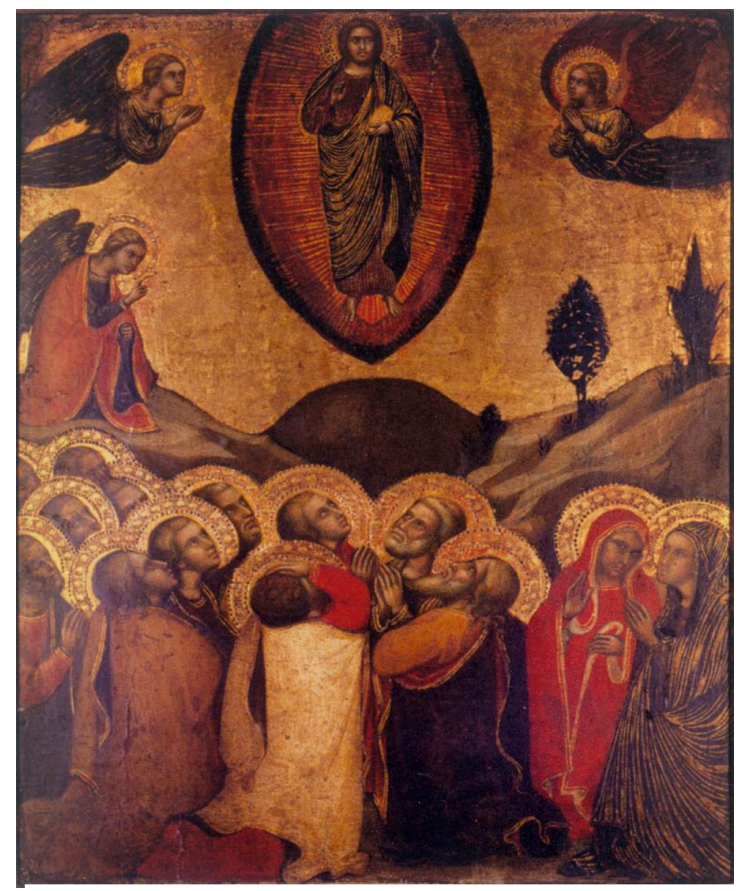
Figure 13 Barnaba da Modena Ascension , 1377 with Mandorla Halo

The use of gold gilding flourished in Medieval sacred art and was especially